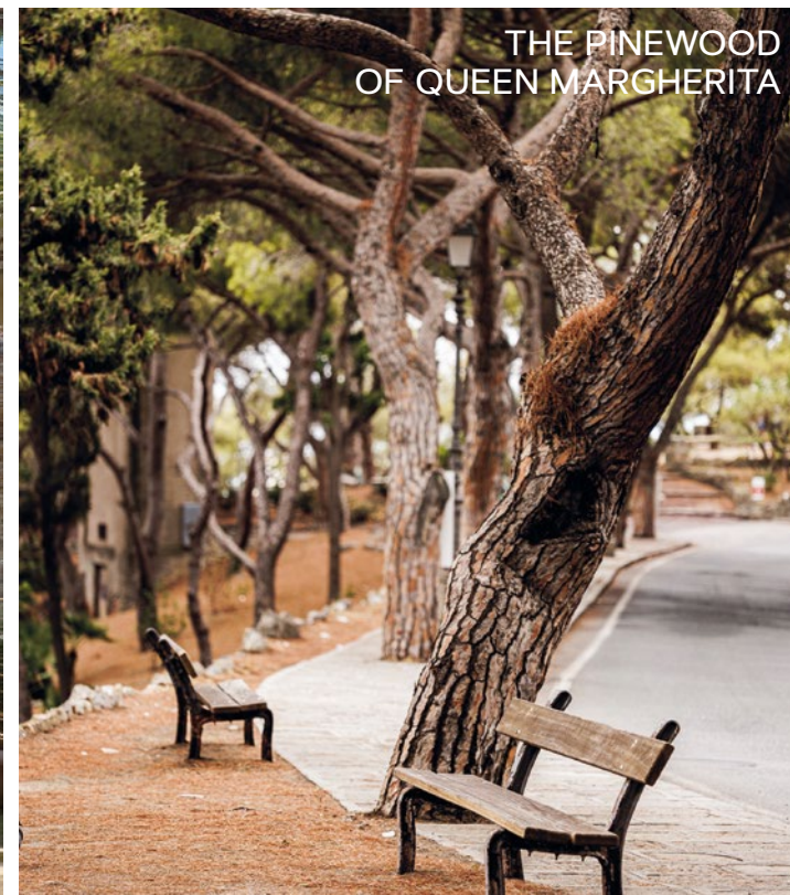
THE PINWOOD OF QUEEN MARGHERITA