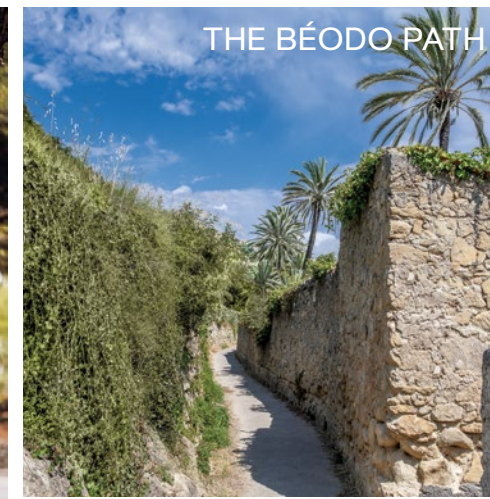
THE BÉODO PATH