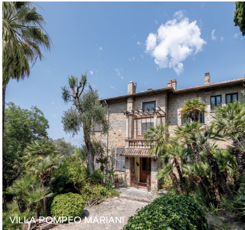
VILLA POMPEO MARIANI