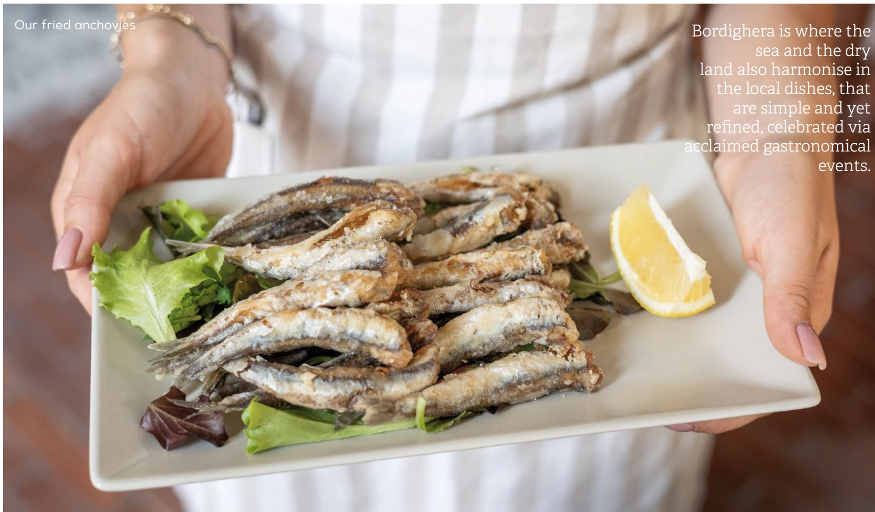
Our fried anchovies

Bordighera is where the sea and the dry land also harmonise in the local dishes, that are simple and yet refined, celebrated via acclaimed gastronomical events.