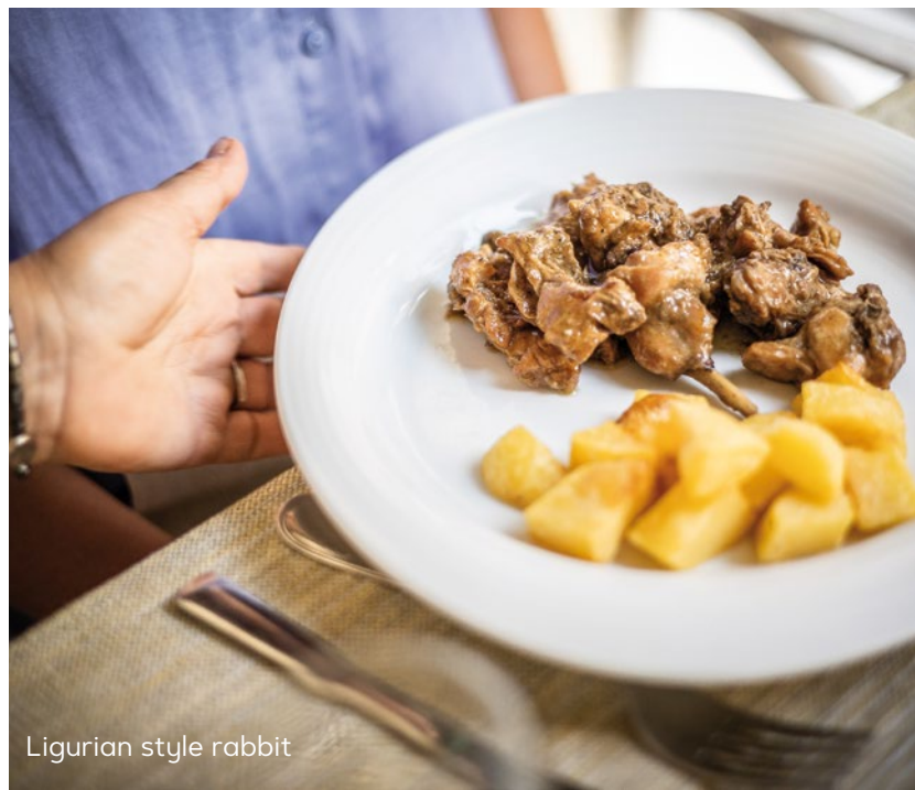
Ligurian style rabbit